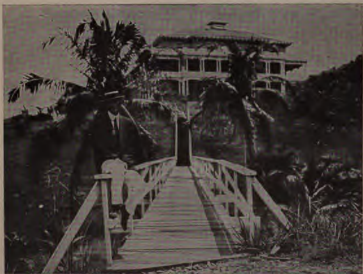
The "Thousand Stairs"